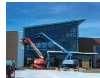
Missouri City Campus

HCC Trustee, District VII HCC Board of Trustees, Secretary