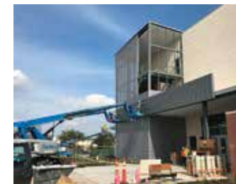
West Houston Institute