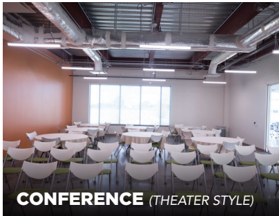
CONFERENCE (THEATER STYLE)