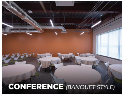
CONFERENCE (BANQUET STYLE)